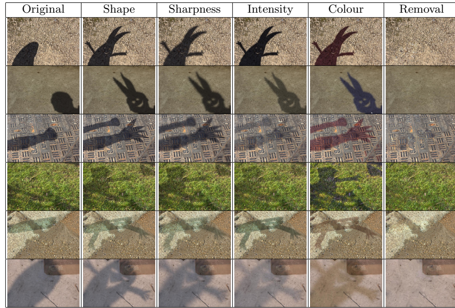
Fig. 3. Demonstration of shadow editing in different scenes: The first two rows are examples of easy scenes. The remaining rows are examples for scenes with strong texture background, broken shadow, coloured shadow, and soft shadow respectively.

The shadow editing steps for various modification and shadow scenes are show in Fig. 3. Please also see our supplementary material for the video demonstration of these examples. Our algorithm is implemented in MATLAB script (non-MEX) and it shows near-real-time interactive performance on a 2.4G hz machine.